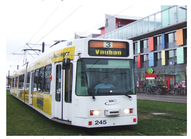
Tram in Vauban; Source: FrancoisFC, https://commons.wikimedia.org/wiki/File:Vauban_3.jpg

In accordance with the building regulations every household in Vauban must provide evidence of a parking space. Residential parking is concentrated in parking garages on the fringe of the suburb so that residents need to walk or cycle to their car. There is no public car parking in the residential streets, but they can be used for loading and unloading. Only the main road provides paid parking spaces. Households can pledge to live car-free and own a "virtual" car space, i.e. they sign an agreement with the car-free association and the city and only have to provide formal proof of a parking space (FIS 2019). These "virtual" parking spaces are officially located on open space provisions within the area. If the existing parking garages did not provide sufficient space for residential parking because more households wish to own a car these open spaces could be used to build additional parking garages. But for now, they provide public open space for the residents (Sperling & Linck 2016).