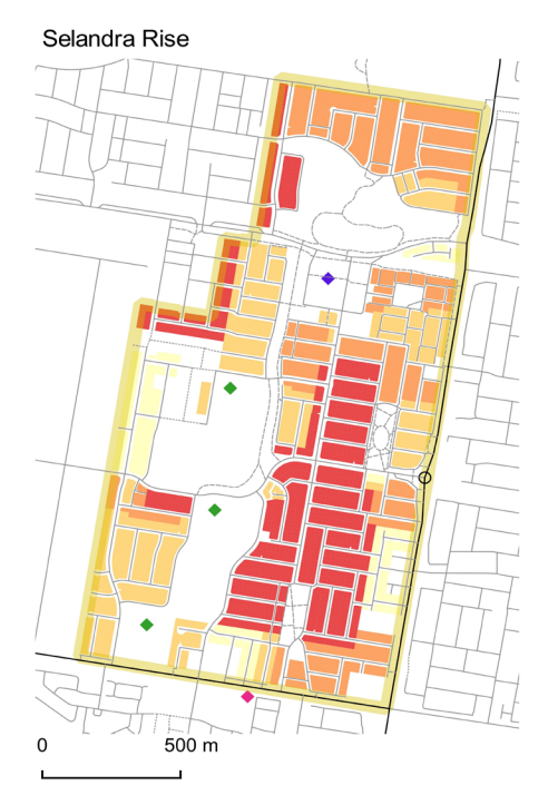
Figure 1: Development stages at Allura and Selandra Rise